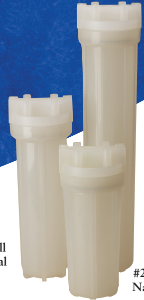
#12 All Natural